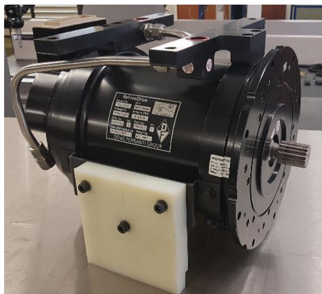
Figure 1 RFD Induction Machine complete assembly.

The manufacturing goals were fulfilled with a large deviation in time, which is in major part attributable to the stops of the productions activities, due to the Covid-19 pandemic. The time delay causes the postponement of the dynamic testing activities, related to WP7 deliverable D7.1.